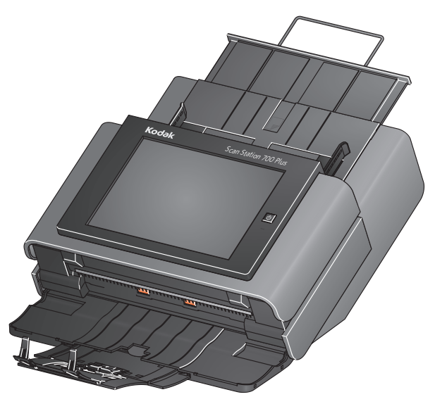
User Reference Guide