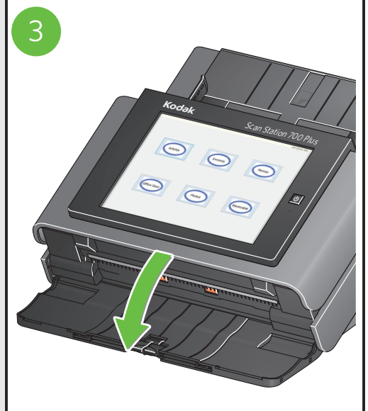
Adjust side guides.