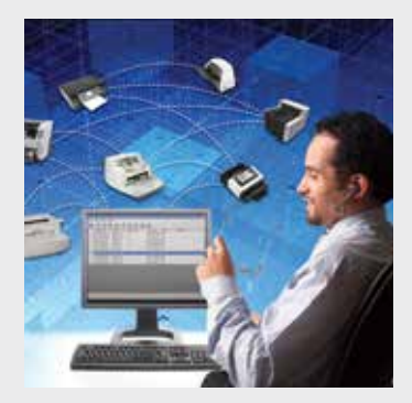
European financial services firm centralizes job setup, license distribution, and software installation with Network Edition

Results: Faster access to information and case processing, better client service, reduced risk of fraud, and rollout of system to 27 other county departments, thanks to results from social services solution.